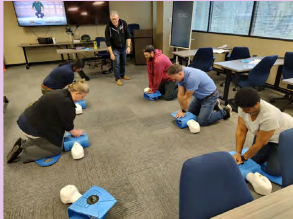
NCDOL employees participating in a CPR training class.