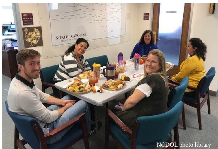
NCDOL employees enjoy the Standards and Inspections Thanksgiving lunch on Nov. 16.