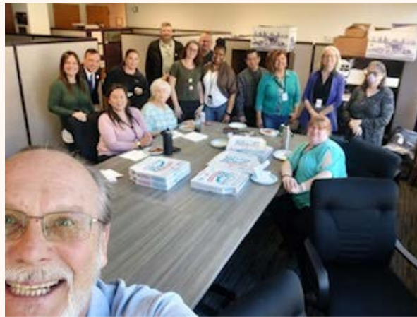
2nd Floor ORB pizza party for having won Penny Wars!