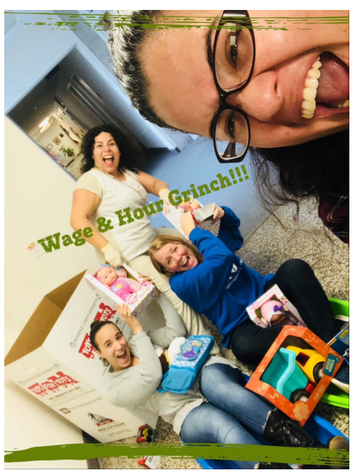
2nd Place: Wage and Hour Grinch