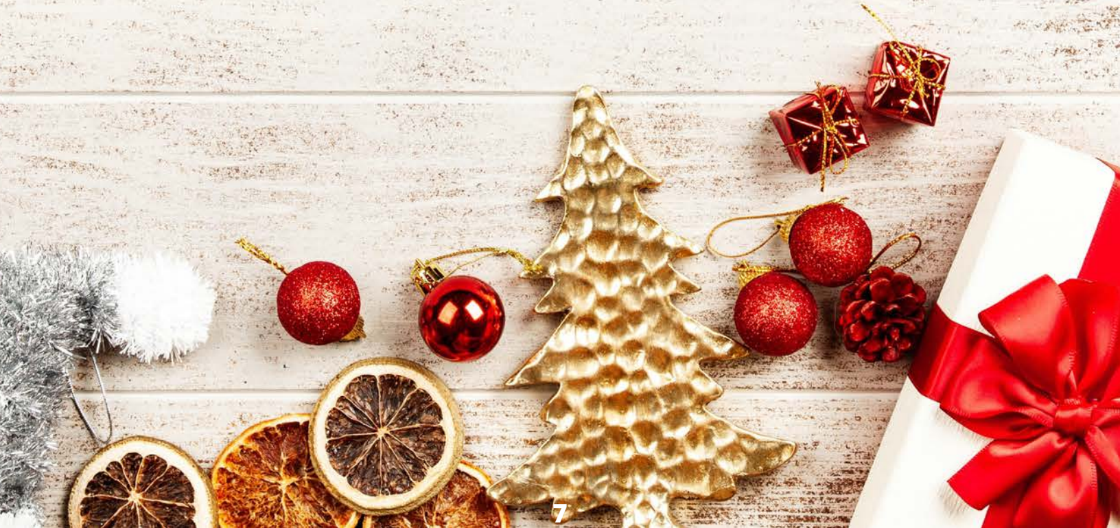
Skyler Allen, 3rd Place