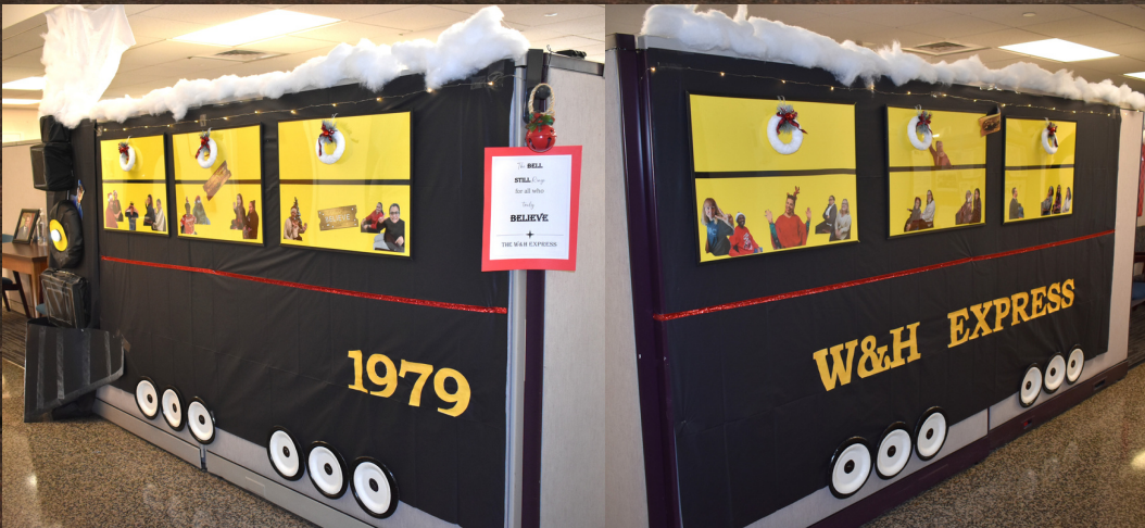
Wage and Hour Bureau, 2nd Place