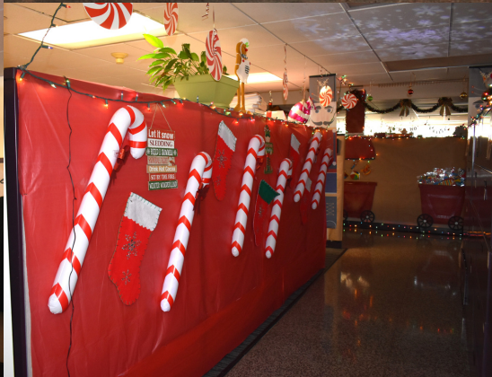
PSIM Bureau, 1st Place