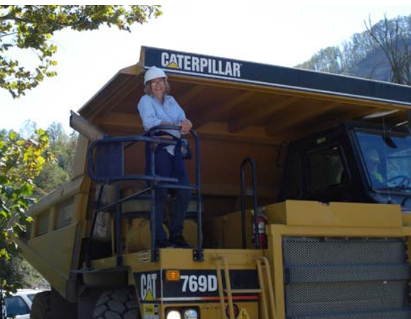
Labor Commissioner Cherie Berry gets ready to enter the cab of the Cat-769.