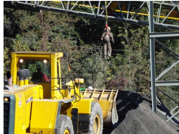
A mannequin hangs from a line in this rescue drill at Harrison Construction's Dillsboro Quarry.