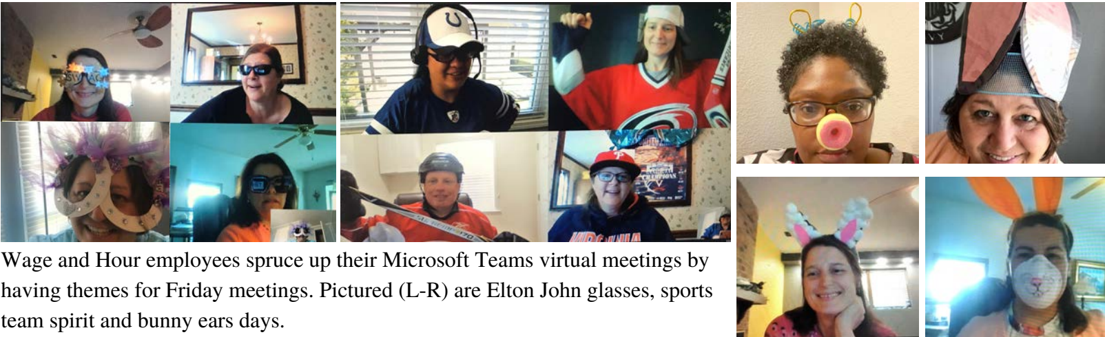
Wage and Hour employees spruce up their Microsoft Teams virtual meetings by having themes for Friday meetings. Pictured (L-R) are Elton John glasses, sports team spirit and bunny ears days.