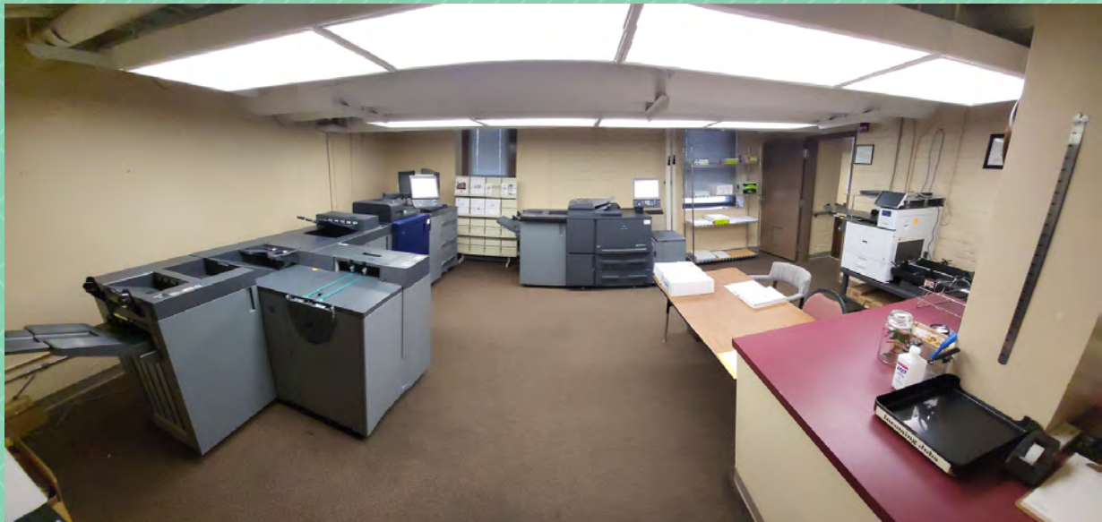
Konica Minolta C4070 (Left), Konica Minolta Biz-Hub Pro 951 (Center) and XANTE Digital Envelope Press (Left).